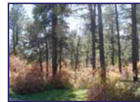
0.36Ac+- Great S Exposure, Pines, E Mtns, Gentle Slope (306887) tcv, lot 587 >Capitan Cir 142 (wear-esm)