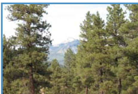
MARTINEZ MOUNTAIN ESTATES

P38 LEMOINE 3.50 ACRES (+-) -- Nicely Treed, Easy Build Level Lot With Views Of Pagosa Peak In Upscale Neighborhood. Very Close To National Forest Access. >On Coronado Cir 500, (lemoine-dav) (585671) martinez mountain estates 2, lot 41 $240,000