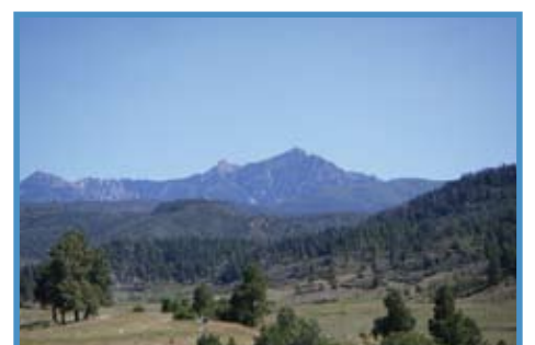
SOUTH SHORE ESTATES

P39 FUERST & RAO 3.07 ACRES (+-) -- One-Of-A-Kind Property In Exclusive South Shore Estates W/ Over 500 Ft Of Lake Hatcher Frontage, Stunning Mountain Views To The North & East, Martinez Canyon To The South. >On La Ventana Pl 119, (fuerst-mas) (307509) south shore estates, lot 04 $499,000