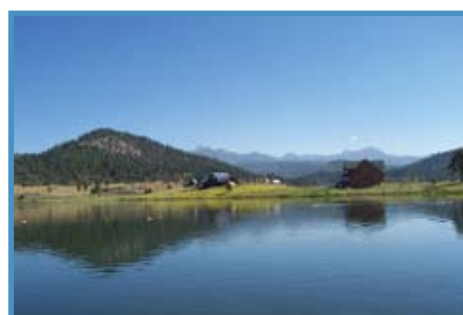
SOUTH SHORE ESTATES

P42 KOURI ACRES 3.61 (+-) -- Pagosa Peak Views, Trees and Meadow, Convenient to N Pagosa, Priced right at 190,000. Level Easy Build Lot close to National Forest. >On Coronado Cir 363, (kouri-dat) (585671) martinez mountain estates 2, lot 16 $190,000