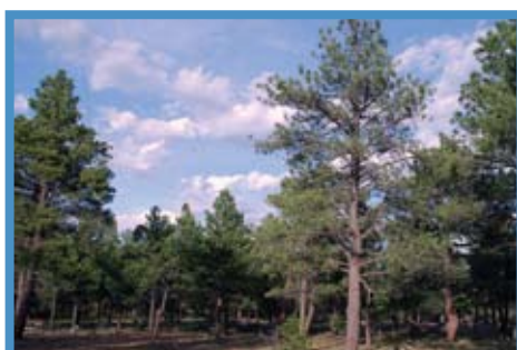
MARTINEZ MOUNTAIN ESTATES

P37 BILGER 3.05 ACRES (+-) -- 3+ Beautiful Acres In Sought After Martinez Mountain Estates. Almost Level With Meadows, Trees And Lovely Pagosa Peak Views. Horses Welcome. Close To Paved Road. >On Old Sawmill Cir 532, (bilger-mas) (587016) martinez mountain estates 1, lot 19 $220,000