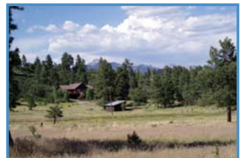
MARTINEZ MOUNTAIN ESTATES

P36 WELLMAN 2.35 ACRES (+-) -- Fabulous Un-Blockable Views Of The N & E Mtn Ranges. Slight Rise To Property, Lots Of Pines & Oaks Towards The Rear Of Property, Paved Rd & Close To Equine Center & Club House >On Shooting Star Dr 450, (wellman-esm) (581738) colorado timber ridge 4, lot 186 $249,000