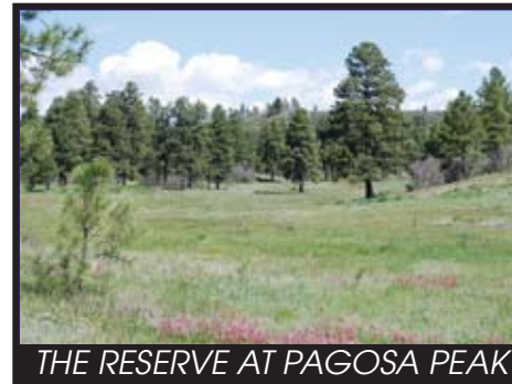
THE RESERVE AT PAGOSA PEAK

D15 WILLETT 17.77 ACRES (+) - Enjoy Magnificent Rocky Mt & San Juan River Views. The Only Neighbor Is The Abundance Of Wildlife. Recently Surveyed With Phone & Elec On Property. >On County Rd 500 Esmt X, (willett-grl) (307857) san juan river estates 2, tract 9-10 & 12 $150,000