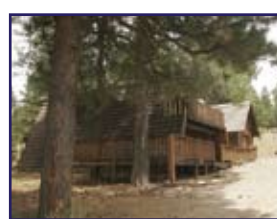
The Herman Home MLS 314109 $182,000