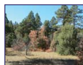
Three Acres, Bystedt MLS 593150 $317,000