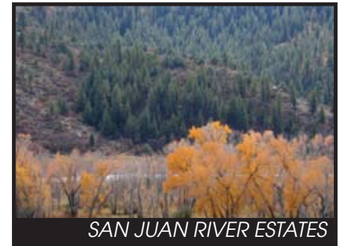
SAN JUAN RIVER ESTATES

D14 BROWN .25 ACRES (+) - Great Downtown Location Close To Shopping And The Hot Springs. Paved Road And All Utilities In Place. North Range Mountain Views. One Of The Few Lots Available In Old Town. >On S 7Th St 310, (brown-his) (584048) Pagosa Springs, Blk 50, Lot 10 $57,000