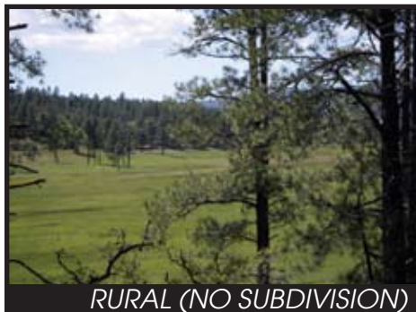
RURAL (NO SUBDIVISION)

D19 PASKEY 10.28 ACRES (+) - Three Parcels Make Up Ten + Beautiful Green Valley Equestrian Acres. Alos Parcels Can Be Purchased Separately With Possible Owner Carry. >On Roush Dr 2081, (paskey-gun) (585007) teyuakan 2, lot 18 $368,500