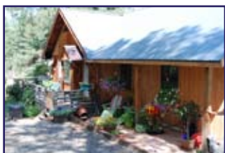
The Cole Home MLS 588804 $169,000

Call (970) 264-2200 For More Info on These Listings