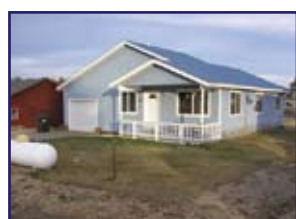
The Stuckwisch Home MLS 593954 $184,900