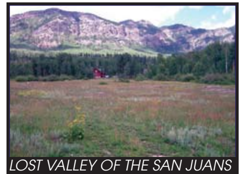
LOST VALLEY OF THE SAN JUANS

D20 SCHAFFER 3.51 ACRES (+) -- Rare Find! Located On Prestigious Snowball Rd! Fabulous Views Of The Historic Valley & Pagosa Peak! Nice Secluded Parcel With Lg Pines, Oaks, City Water, Electric & Telephone >On County Rd 200 X, (schaffe-esm) (585607) schaffer minor, Lot 02 $269,000