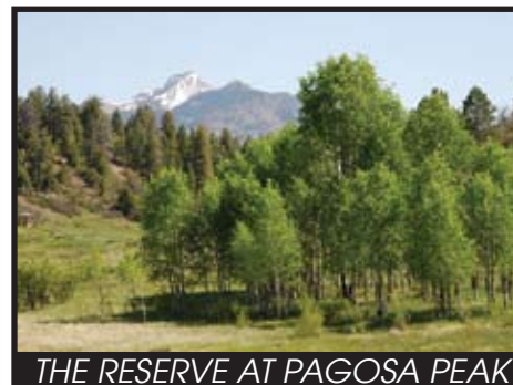
THE RESERVE AT PAGOSA PEAK

D16 SINGLETERRY .61 ACRES (+) -- Pretty Wooded Lot With Pagosa Peak Views. Located In The Prestigious Reserve At Pagosa Peak, Paved Roads, Onsite Concierge, Playgrounds, Picnic Areas And 105 Acres Open Space >On Chase Ct 83, (singlet-dav) (307967) reserve at pagosa peak 1, lot 09 $119,000