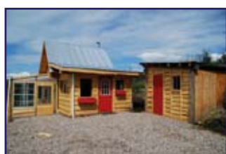
The Keefe Home MLS 592035 $125,000