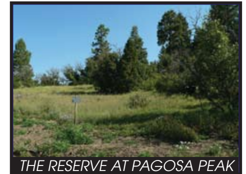
THE RESERVE AT PAGOSA PEAK

D17 SINGLETERRY .93 ACRES (+) -- Gorgeous lot w/ huge Pagosa Peak views & beautiful aspen grove. Located In the Prestigious Reserve At Pagosa Peak, Paved Roads, Onsite Concierge, Playgrounds, Picnic Areas. >On Dylan Dr 39, (singlet-dav) (588806) reserve at pagosa peak 2, lot 36 $199,000